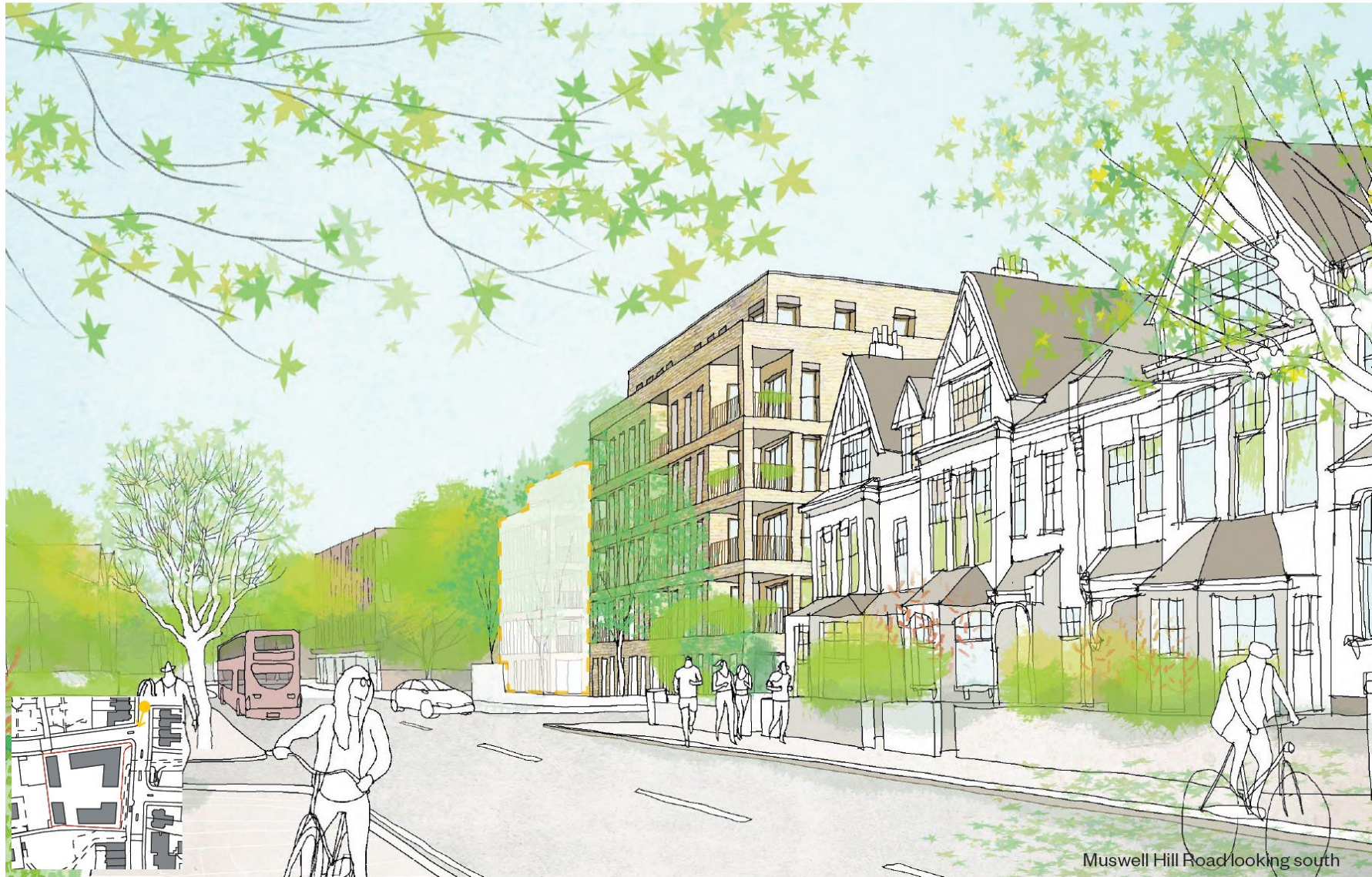
Muswell Hill Road looking south